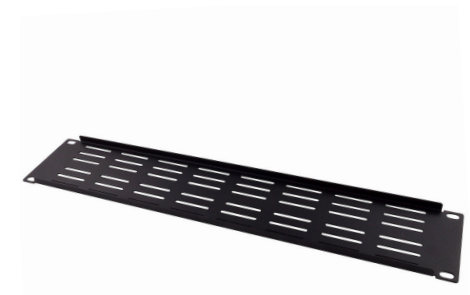
XXRU 19" VENTED BLANKING PANEL

PART NUMBER : BP-XX (XX = Number 01, 02, 03, 04)