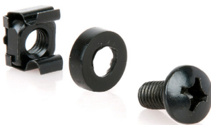
Heavy Duty M6 Cage Nuts, Washer & Screw Set : Pack of 100 : BLACK

PART NUMBER : CB-1P-BK-50 , CB-1P-BK-100