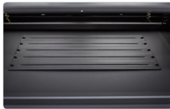
Ample cable entry glands at the bottom