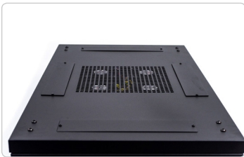
Multiple cable entry glands at the top