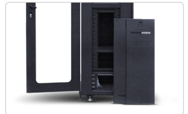
Removable side panels