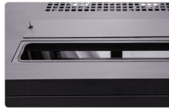
Nylon bush lining in all cable entry glands to protect from wear and tear