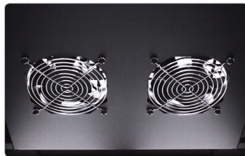
Included roof fan kit