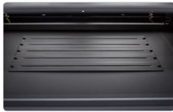
Ample cable entry glands at the bottom