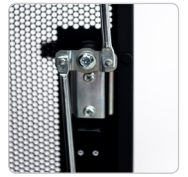
Rear Split Mesh Door + Door Lock