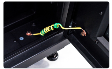
Earth straps on front and rear doors