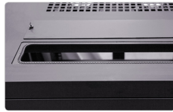
Nylon bush lining in all cable entry glands to protect from wear and tear