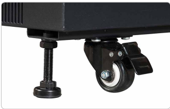
Pre-installed lockable castors and stabilising feet