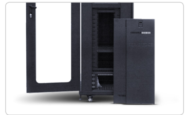
Removable side panel