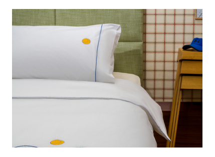
KIDS DUVET SETS