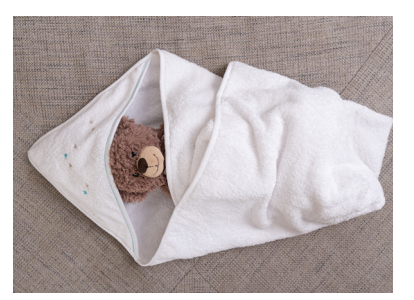
BABY SWADDLE TOWEL SETS