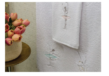
KIDS TOWEL SETS