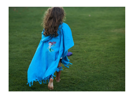
KIDS BEACH PONCHOS