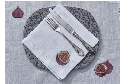
PLACE MAT SETS