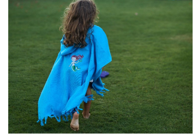
KIDS BEACH PONCHOS