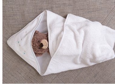
BABY SWADDLE TOWEL SETS