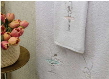
KIDS TOWEL SETS