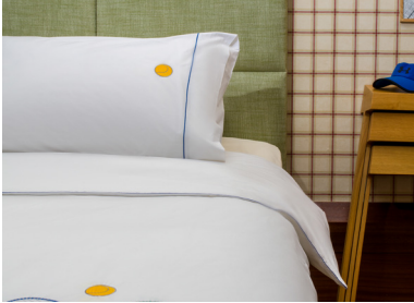
KIDS DUVET SETS