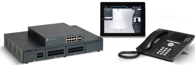
Figure 1: ERS 3500 empowers IP Phones and Unified Communications

With LLDP enabled, the ERS 3500 learns the identification of neighboring devices and provides these details to the network management system. This enables the system to have the most up-to-date physical view of the network. In addition, ERS 3500 can dynamically apply voice VLANs and QoS to both the IP Phone and the attached Edge Switch port. When the IP Phone is moved to another location, the configuration is automatically updated. QoS is also automatically provisioned on the ERS 3500 uplink ensuring voice is given top priority into the Core. With one of the most comprehensive implementations of LLDP in the industry, Extreme offers enhancements for standards based provisioning of Extreme IP Phones via integrated and customizable TLV support.