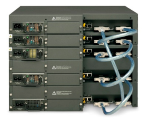
ERS 5600 Stacking Cable Inteconnection

From a management perspective, our Stackable Chassis appears as a single networking entity – utilizing only a single IP Address. This can significantly reduce the number of switches to be managed within the network as a stack of up to 8 switches can be managed just as easily as a single switch. Distributed real-time monitoring of the Stackable Chassis also provides an at-a-glance view of operational status and health which