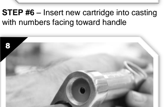
STEP #8 – Insert black rubber washer first and then hard plastic washer