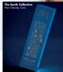
The Earth Collective Hair Density Tonic

Invest in a good haircare routine. Oil your scalp and leave it overnight. Wash with a nourishing shampoo and conditioner. Rinse and towel-dry your hair. Follow with a leave-in conditioner. Part your hair in the centre and finish with a spray of a volumising mist.