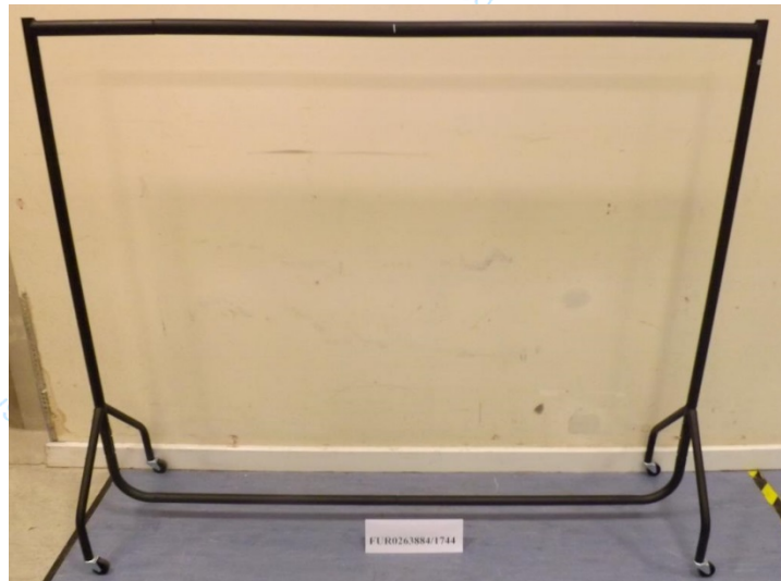
Photo showing the end view of the 'Heavy Duty Clothes Rail 2ft-6ft':