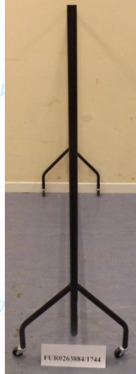
Photo 3, showing the 'Heavy Duty Clothes Rail 2ft-6ft' after the failure: