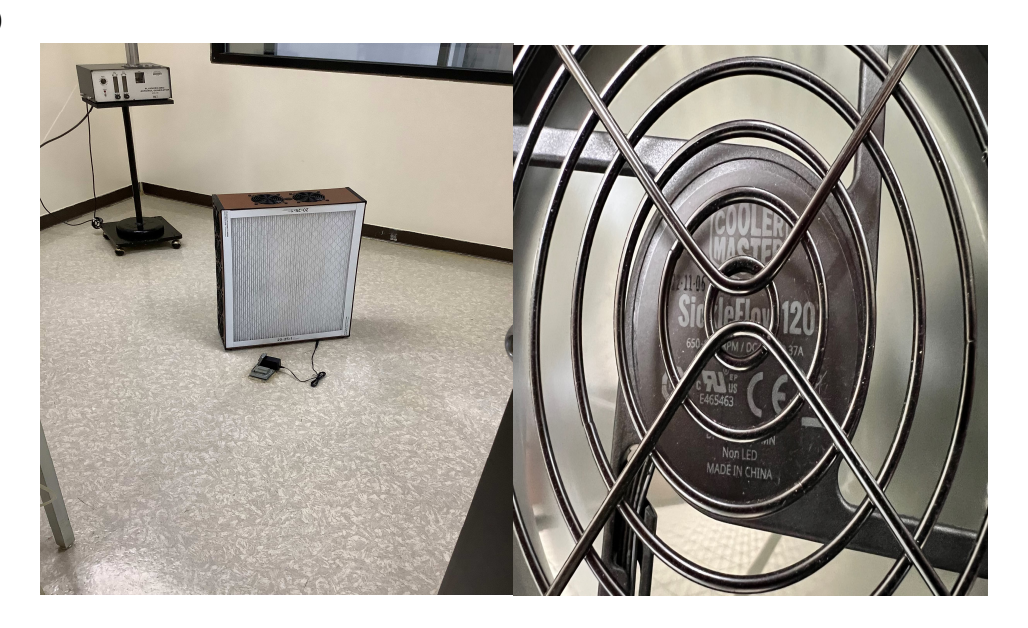
Unit in Test – Sickleflow Fans – 7 Fan Configuration