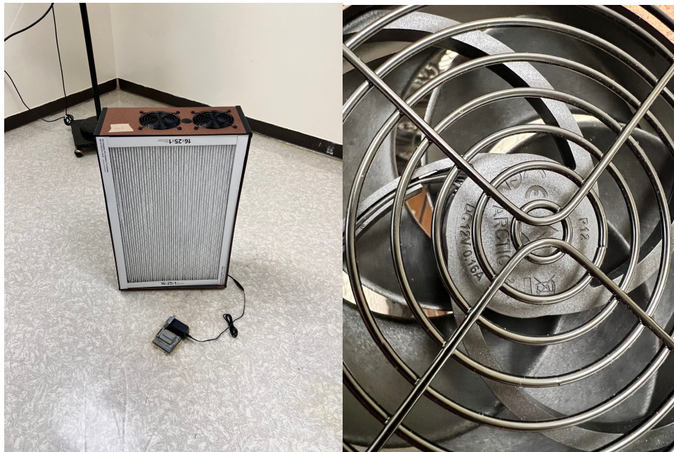
Unit in Test – Arctic P12 Fans – 7 Fan Configuration