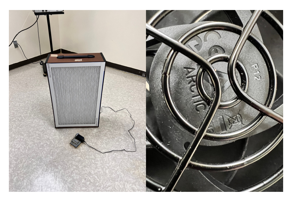
Unit in Test – Arctic P12 Fans – 5 Fan Configuration