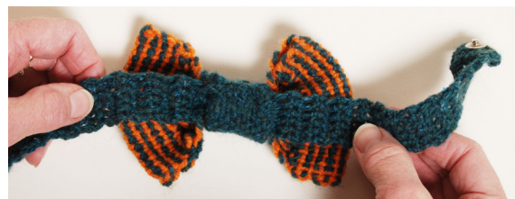
Slide the band through the loop.