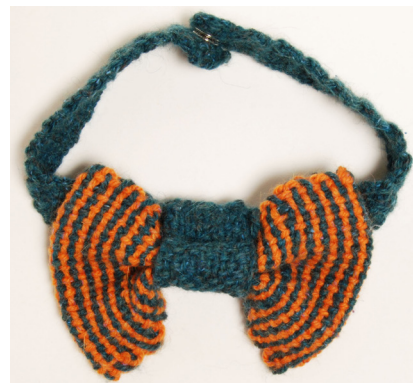
Close-up of the Zippy Bow Tie.