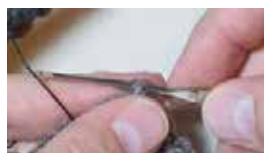
PATH OF CROCHET HOOK THROUGH LOOP PAIR