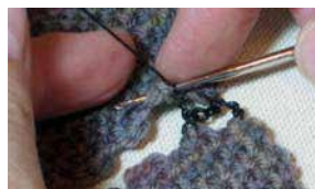
SC, CH3, SC ACROSS