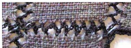
CLOSE-UP OF FINISHED JOINING