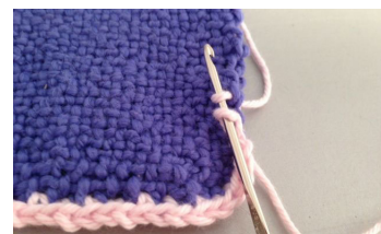
Joining the squares with crochet

using for joining and pull it to the top. Wrap the yarn over the hook and pull it through the loop already on the hook. Insert the hook through the next set of loops and hook the yarn again. Pull it up. You now have two loops on the hook. Wrap the yarn over and pull it through both loops on the hook. If there is a large gap between sets of loops, make an extra chain stitch to bridge the gap. Adding in a chain stitch will keep the edges from puckering and drawing in. At the corners go into the loops an extra time or two to make extra stitches to turn the corner without puckering. When you get back to where you started, make an extra chain stitch and pull the yarn through. Work it back into your stitching and you are done!