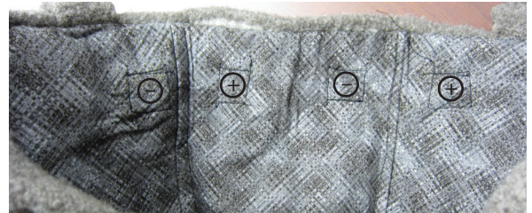
orientation of magnets

Using small squares of lining fabric, make pockets on the wrong side of the lining. Insert a magnet using the orientation shown above, and sew the pocket closed. The pockets are approximately 1" from the seam and 1-1/2" from the top edge of the bag. You may choose to adjust these measurements depending on how much your bag felted and how the end folds up. Repeat for the other end of the bag.