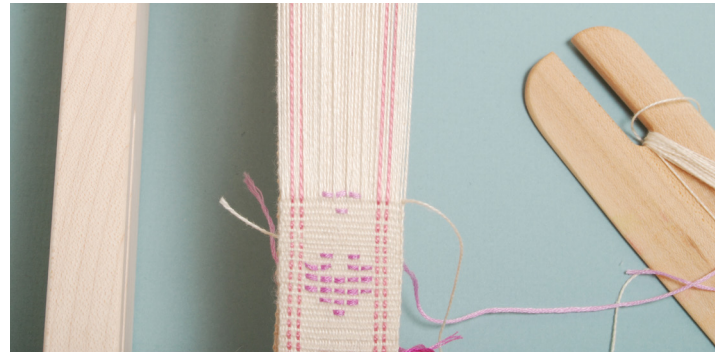
WEAVING PATTERN ROW 2