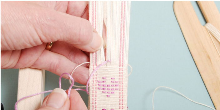
WEAVING PATTERN ROW 1