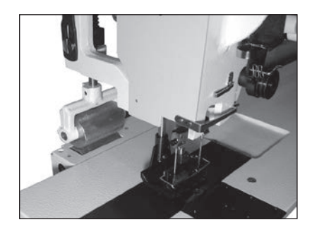
Clutch driven puller feed