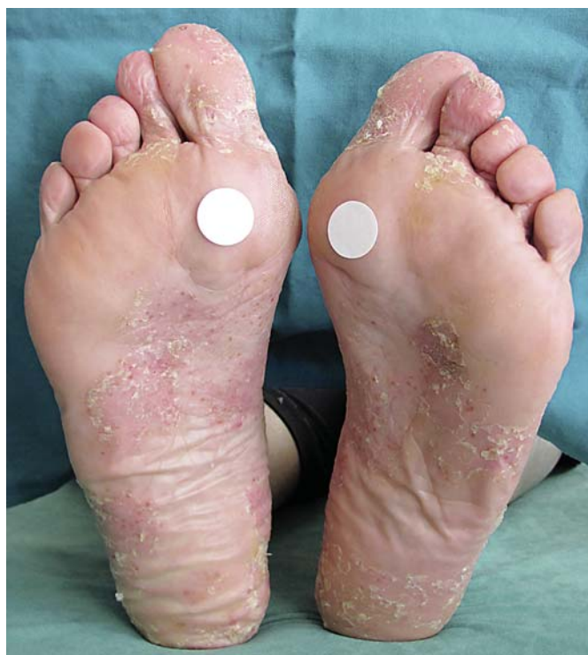
Fig. 1. Baseline characteristics of pustular lesions considered in the study. On the upper side of each foot, the metric patch used for image analysis is visible.

Photographs under visible light were taken in standard conditions by using the same machine at the same distance (30 cm), uniform room illumination, neutral background and adhesive metric references of known extension in order to get the real scale of acquired photographs (fig. 1). The primary outcome measure was the percentage reduction from baseline of lesion areas evalu-