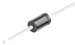
DO-41 Glass case COLOR BAND DENOTES CATHODE