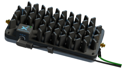
CEL-FI ROAM R41