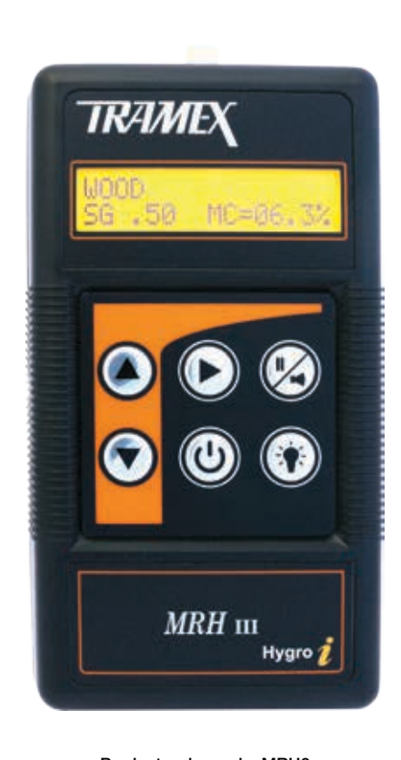
Product order code: MRH3

The Moisture and Relative Humidity MRH III is a hand-held digital moisture meter calibrated for most building materials. It also incorporates optional plug-in heavy-duty pin-type wood probes and Hygro-i ® probes for measurement of relative humidity and ambient conditions and allowing for testing of concrete per ASTM F2170 or BS 8201 (with optional sleeves or hood). Suitable for many industries including Flooring, Water Damage Restoration, Indoor Air Quality, Home Inspection and Pest Control.