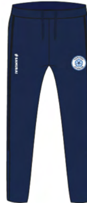
U: 0200 TAPERED TRAINING PANT