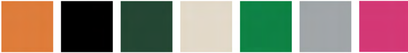
AUS GOLD 01