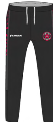
TAPERED TRACK PANT