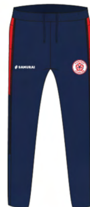
TAPERED TRACK PANT