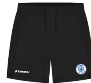
EP: 0100 CLIPPER SHORT