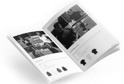
CLICK FOR FULL CORE STOCK RANGE