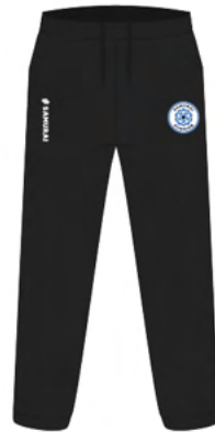
EP: 0103 REVOLUTION TRACK PANT 2.0