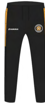
TAPERED TRACK PANT