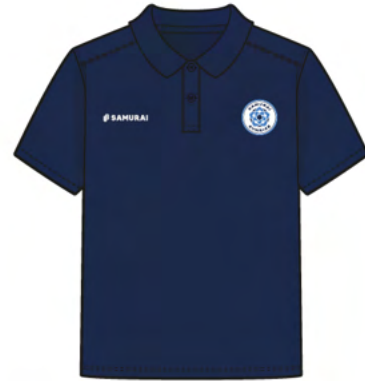
EP: 0111 PERFORMANCE POLO 2.0