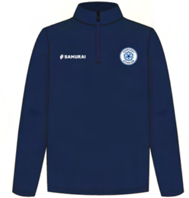
U:0209 QUARTER ZIP PULLOVER