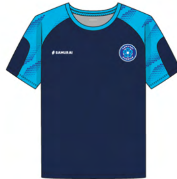
PART SUBLIMATED UP TO 50% SUBLIMATED

The best of both, part-sublimated items combine our exclusive leisurewear themes with endless colour and pattern possibilities. With the ability to contrast different textured fabrics, this option takes our leisurewear ranges one step further.