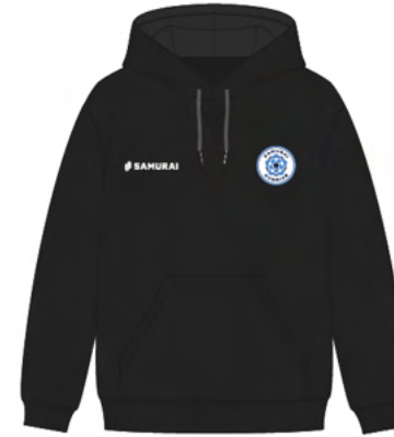
U:0202 CLASSIC HOODIE 2.0