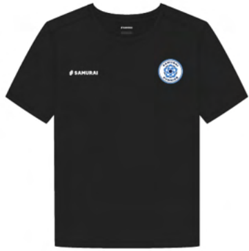
EP:0110 COTTON TOUCH TEE