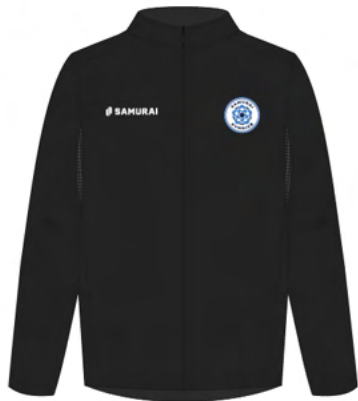
EP: 0102 REVOLUTION TRACK TOP 2.0