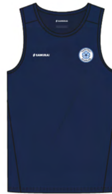
EP:0105 CLASSIC VEST