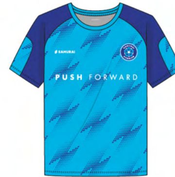
FULLY SUBLIMATED 100% SUBLIMATED

The premium option that offers complete creative freedom - fully sublimated items have infinite design possibilities. Created through the sublimation process of printing directly onto a fabric; this technique gives you an unlimited amount of colour and pattern options to create a truly unique design. Your imagination is the limit.