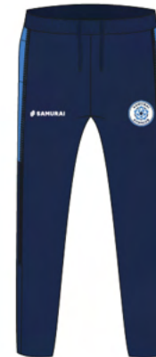
TAPERED TRACK PANT