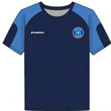
CUT AND SEW

Choosing one of our premium leisurewear ranges is just the beginning - each theme can be expanded upon to create a truly unique design. Choose between our cut & sew, part-sublimated and fully sublimated options for a leisurewear range that is perfectly suited to you.