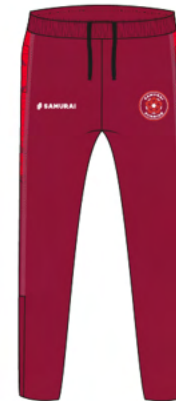
TAPERED TRACK PANT