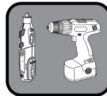
DREMEL / DRILL