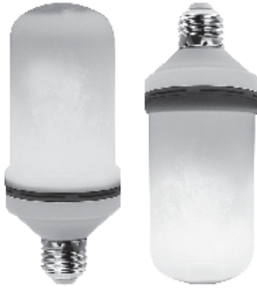
Gravity Induced Flames