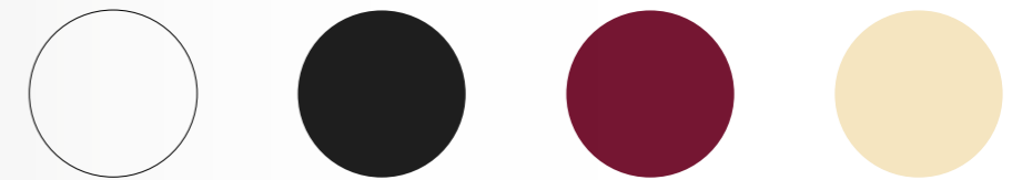
Lacquered iron white RAL 9016 Lacquered iron black RAL 9005 Lacquered iron bordeaux RAL 3005 Lacquered iron beige RAL 1015