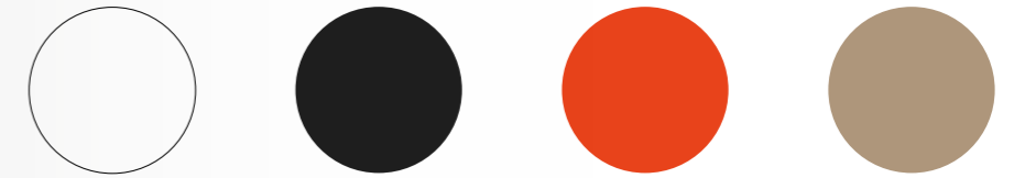
Lacquered aluminum white RAL 9016 Lacquered aluminum black RAL 9005 Lacquered aluminum orange NCS S 1070-70R Lacquered aluminum dove grey NCS S 4010-Y10R