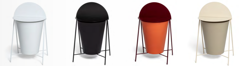
Oh! table White Oh! table Black Oh! table Bordeaux Oh! table Beige