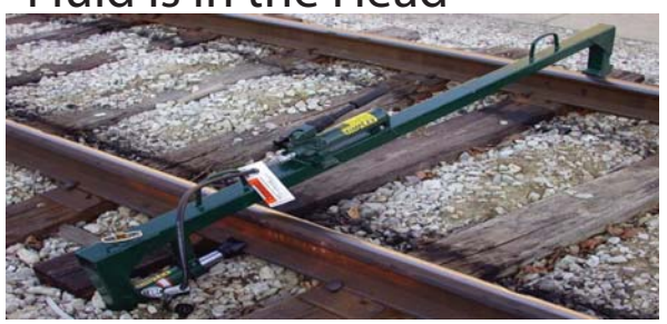
Check to Make Sure "V" Block is Fully Threaded to Cylinder Before Using