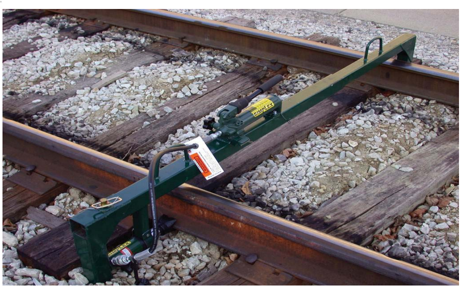
You Can Squeeze or Widen Track