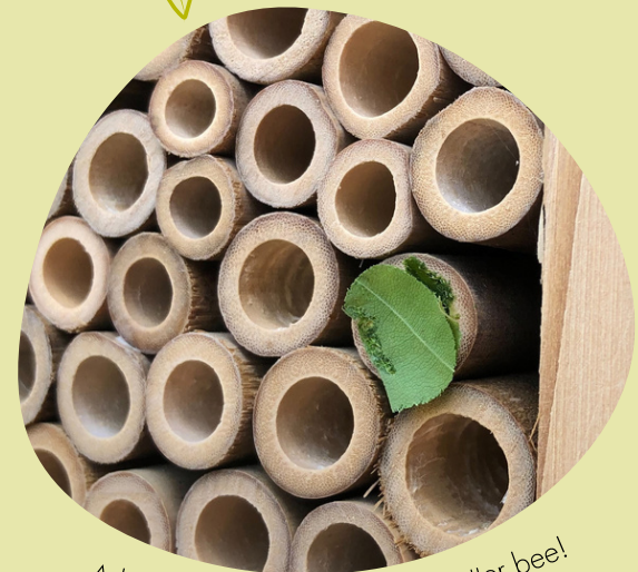
A leaf door, made by a leaf cutter bee!