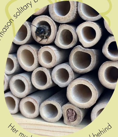
Her mud door with eggs laid behind