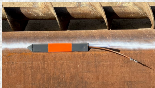
Weld it on, hook it up, and bore