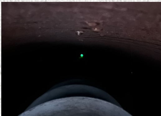
Visible light from over 300ft away!