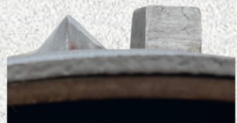
Casing Compass (L) vs Standard Water Level Block (R)... a 64% reduced soil profile

Phone: (661) 399-5000 E-mail: plgboretech@gmail.com Website: www.plgtech.us LinkedIn: PLG Technologies Instagram: @PLGBoreTech YouTube: @PLGTech