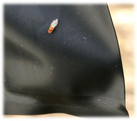
SWD continue to land on lure throughout life of lure.