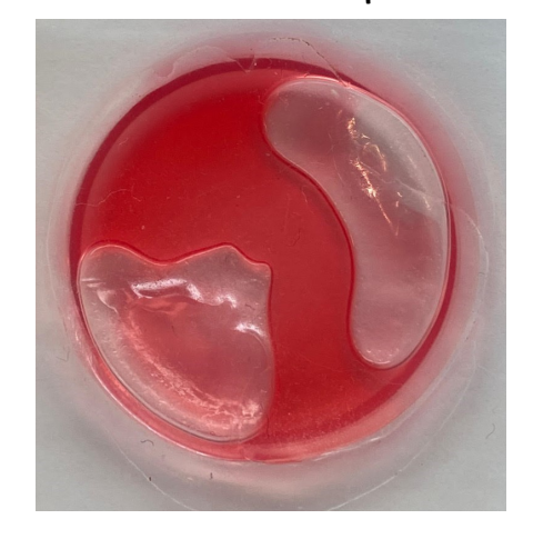
EPA Reg. No. 85354-6

An easy to use Mating Disruption product for control of California Red Scale (Aonidiella aurantii).