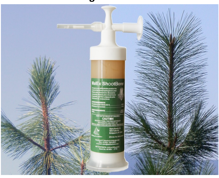
An attracticide product for control of the forest lepidopteran pests: Western pine shoot borer ( Eucosma sonomana ), Eastern pine shoot borer ( E. gloriola ), and the Lodgepole pine shoot borer ( E. recissoriana ).