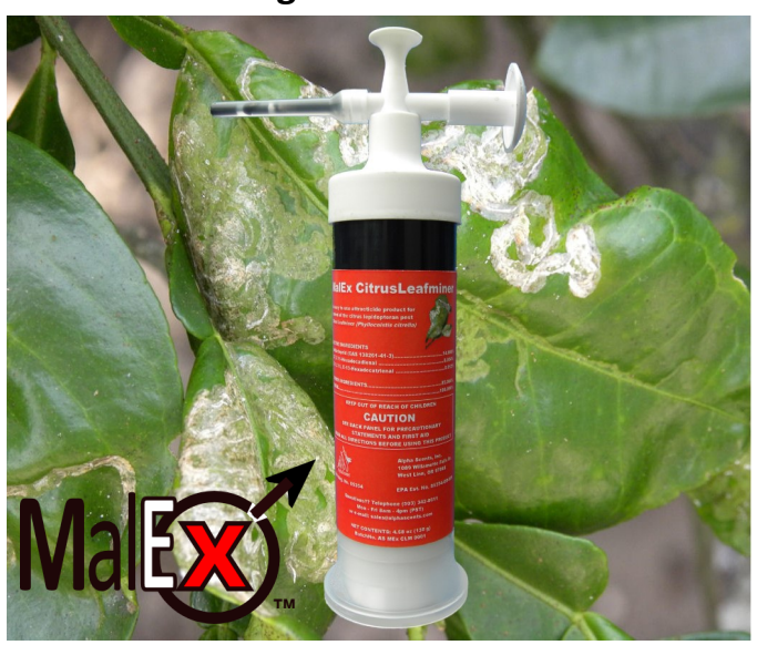
An attracticide product for control of the citrus lepidopteran pest Citrus Leafminer ( Phyllocnistis citrella ).