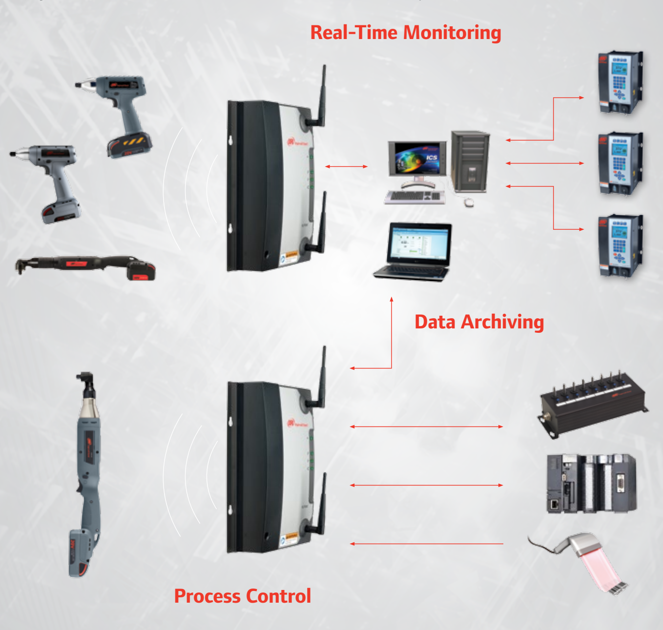
10 to 1: Every Process Communication Module can communicate with up to 10 individual QX Series tools.

Ingersoll Rand doesn't just give you unprecedented technology, we want to give you total control of that technology. Our Process Communication Module allows for control that translates into maximum productivity and efficiency.