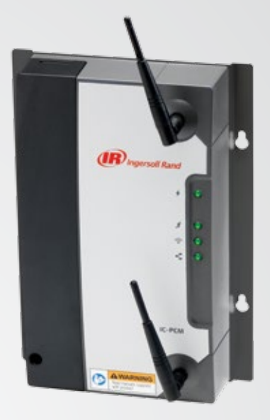
Process Communication Module IC-PCM-2-US