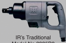
IR's Traditional Model No. 2925B2

Impacttools are the hardest working tools of all. They are put to work in some of the toughest, least forgiving, applications in industry. That's why IR impacttools are designed to take the worst you can give them and still provide the productivity you demand. That's the way IR has always built impacttools, and we will continue that tradition.