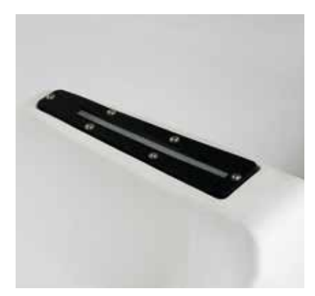
Extra strong no friction daggerboard case, strong and ergonomic.