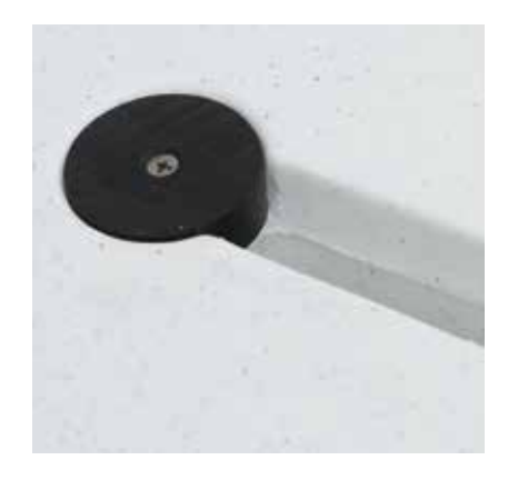
Dagger Board Friction Rubber.