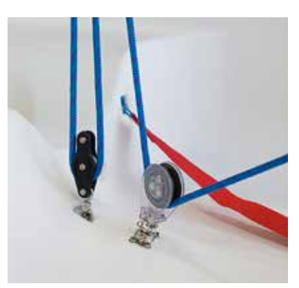
Possibility to put in a ratchet block to create a regatte mainsheet system.