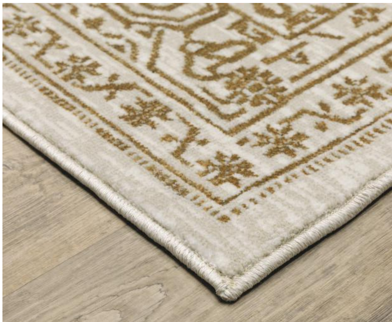
INTRIGUE INT03 CORNER