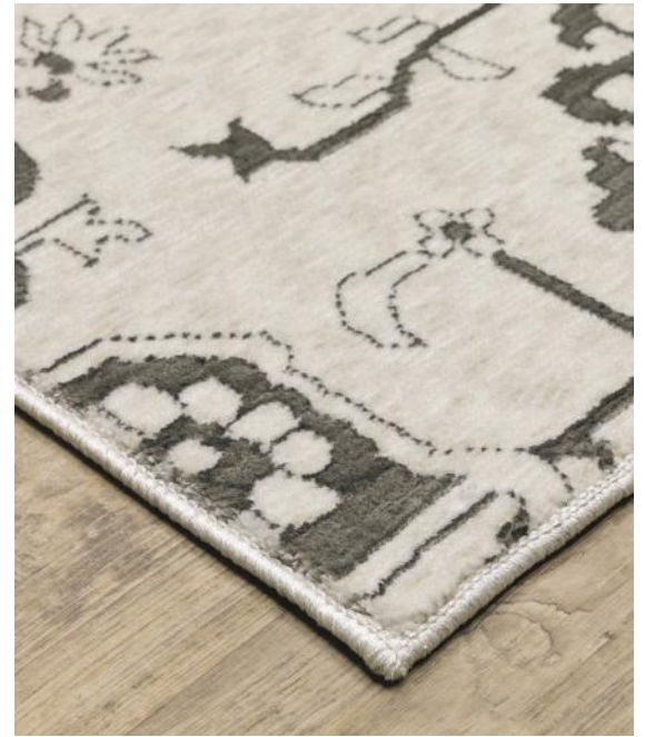
INTRIGUE INT08 CORNER