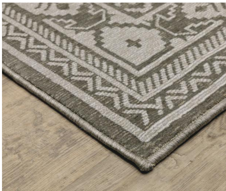
INTRIGUE INTO6 CORNER