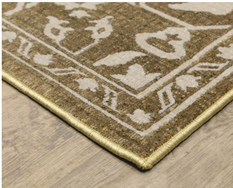
INTRIGUE INT11 CORNER