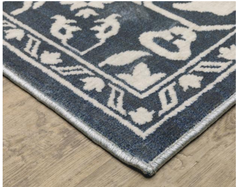
INTRIGUE INT10 CORNER