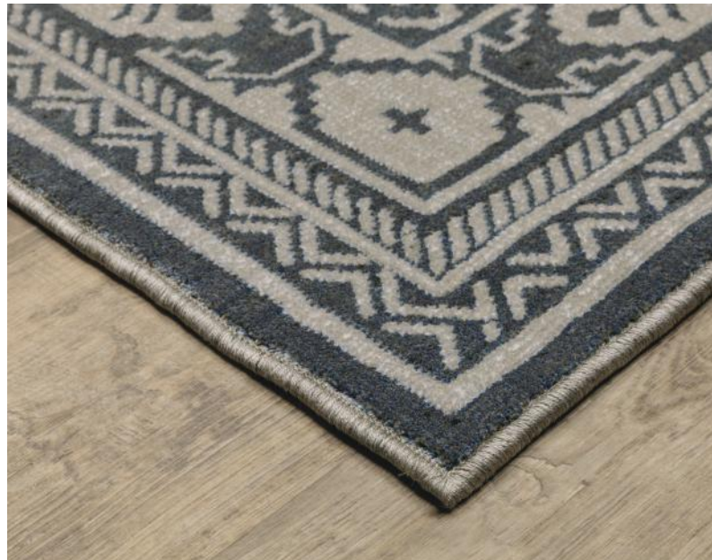
INTRIGUE INTO5 CORNER