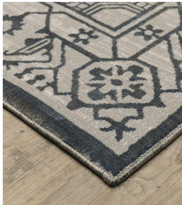
INTRIGUE INT07 CORNER