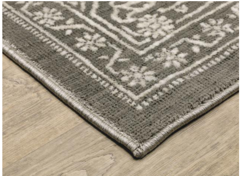
INTRIGUE INT04 CORNER