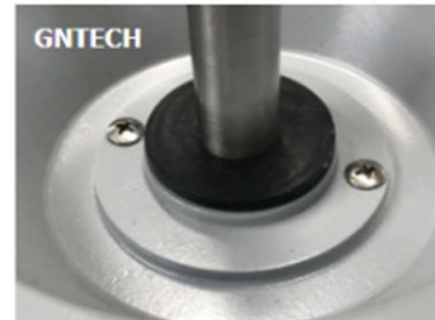
Variable-Speed Motors with new rubber slinger