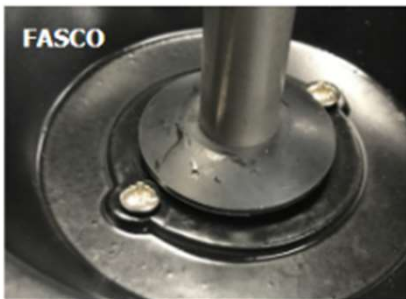
Single-Speed Motors with new rubber slinger

I'm excited to announce that our quality, engineering, and manufacturing teams collaborated on a new slinger project for all AstralPool pumps. We initiated this project in response to reports of pump failures, mainly due to noisy bearings caused by water ingress and motor failures resulting from mechanical seal failures, which were also linked to water ingress.