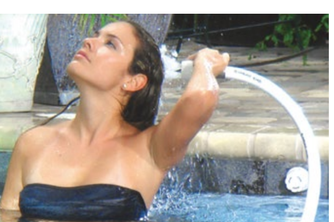
* Optional massage hose