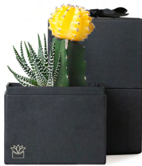
Ray Garden | $36

$13.95 drop shipping | 4.5" x 4.5" x 6.0"