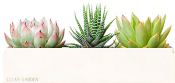
Verdant Garden | $58