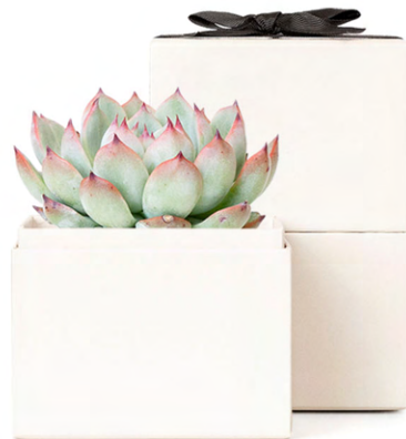
Bliss Garden | $30

The elegant and timeless ivory planter makes this collection the perfect gift for any occasion