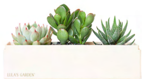
Jewel Garden | $44