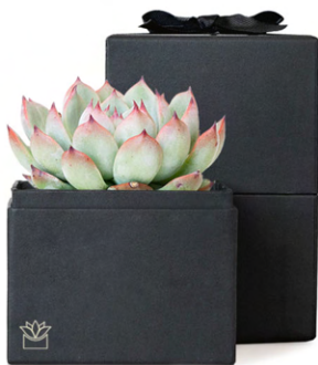
Bliss Garden | $30

$13.95 drop shipping | 4.5" x 4.5" x 6.0"