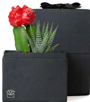
Joy Garden | $36

$13.95 drop shipping | 4.5" x 4.5" x 6.0"