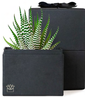
Zebra Garden | $30

$13.95 drop shipping | 4.5" x 4.5" x 6.0"