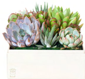
Urban Garden | $105