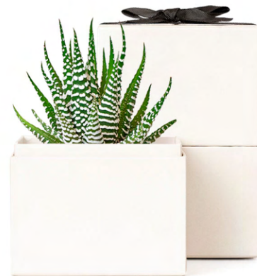
Zebra Garden | $30

$13.95 drop shipping | 4.5" x 4.5" x 6.0"