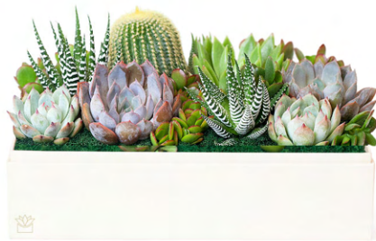
Lush Garden | $135