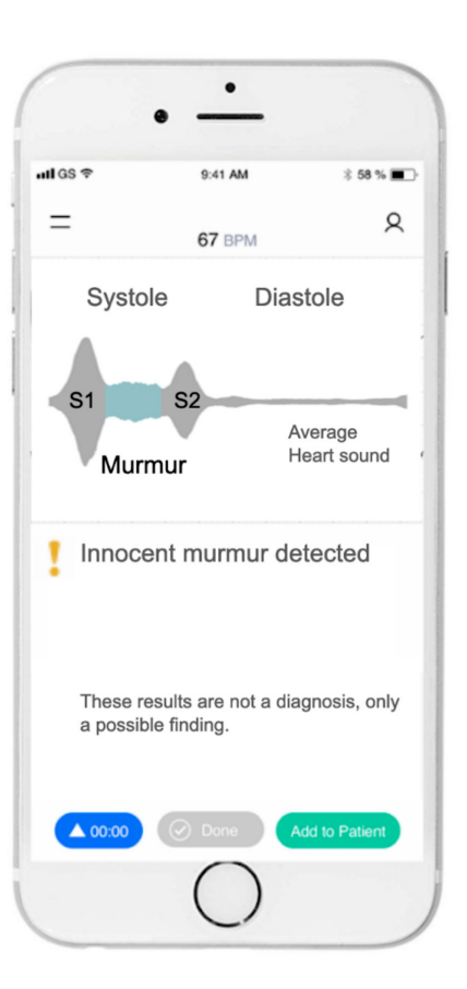
Averaged phonocardiogram with innocent murmur detected and highlighted during systole