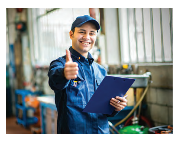
Once the service appointment is fixed, our qualified and trained Crompton service technician will visit & your product problem will be resolved within 24 to 48 hours