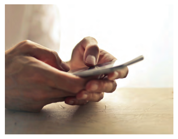
24 hours open chat bot access