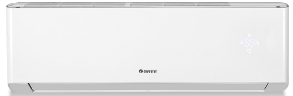
Extreme wall-mounted unit