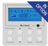
Wired controller (XE-71)