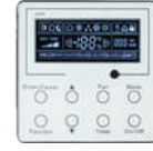
THERMOSTAT (Included) MC20700140 (XK19)