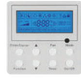
THERMOSTAT (Optional) XK60