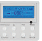
THERMOSTAT (Optional) XE71