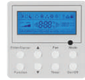
THERMOSTAT (Optional) XK60