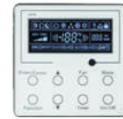
THERMOSTAT (Included) MC20700140 (XK19)