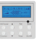
THERMOSTAT (Optional) XE71