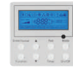
THERMOSTAT (Optional) XE71

Wi-Fi MODULE AVAILABLE TL127000600_L72279