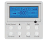
THERMOSTAT (Optional) XE71