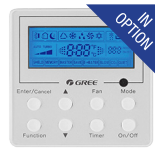
Wired controller (XK-41)