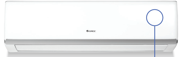
LOMO 23 wall-mounted unit