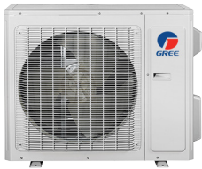
LOMO 23 condensing unit