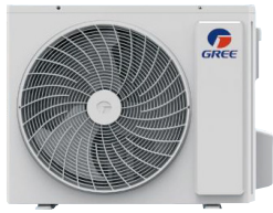
Crossover condensing unit