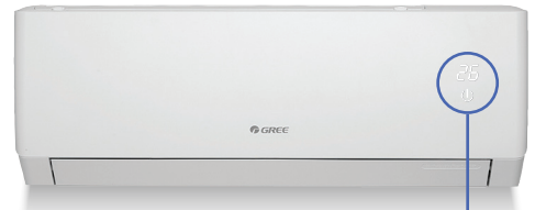
Crossover wall-mounted unit