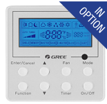
Wired controller (XE-71)