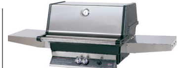
Overall Dimensions (without shelves) 26-3/4" W x 19" H x 25" D