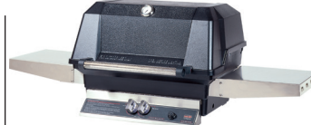
Overall Dimensions (without shelves) 26-3/4" W x 19" H x 24-1/2" D