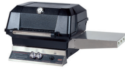
Overall Dimensions (without shelves) 22-1/2" W x 17" H x 24-1/2" D

All grills are available in natural or propane gas LP hose & Regulator available on LP grill models only