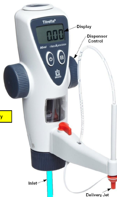
Typical POVA (Pipette and Burette) for illustrative purposes

Note: POVA = Piston Operated Volumetric Apparatus. Piston pipettes and piston burettes are examples of POVA.