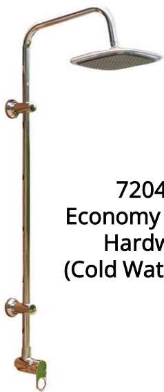
720404 Economy Shower Hardware (Cold Water Only)