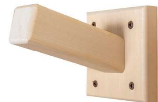
603022 Single Towel Hook (White Cedar)