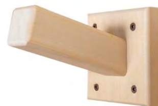
603022 Single Towel Hook (White Cedar)