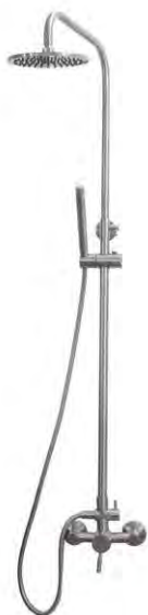
720405 Premium Shower Hardware